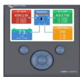
Color Control GX